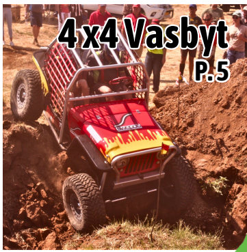
4x4 Vasbyt P.5