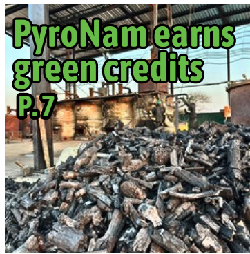
PyroNam earns green credits P.7