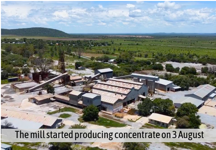
The mill started producing concentrate on 3 August