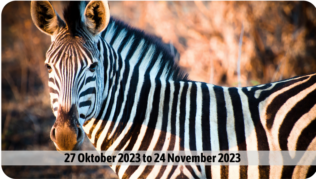
27 Oktober 2023 to 24 November 2023

Want to advertise your event free of charge? Send all details by the 20th of the month to 067triangle@gmail.com.