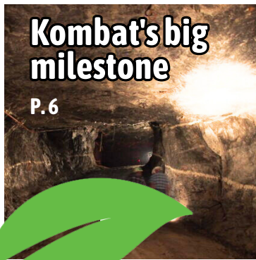
Kombat's big milestone P.6